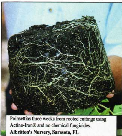
Poinsettias three weeks from rooted cuttings using Actino-Iron® and no chemical fungicides. Albritton's Nursery, Sarasota, FL